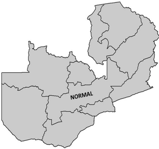
Fig 1. Rainfall Forecast for October-November-December 2014 (OND)