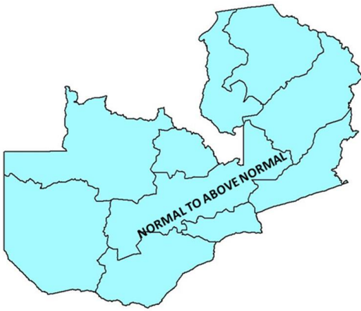
Fig 3. Rainfall Forecast for December 2014-January-February 2015 (DJF)